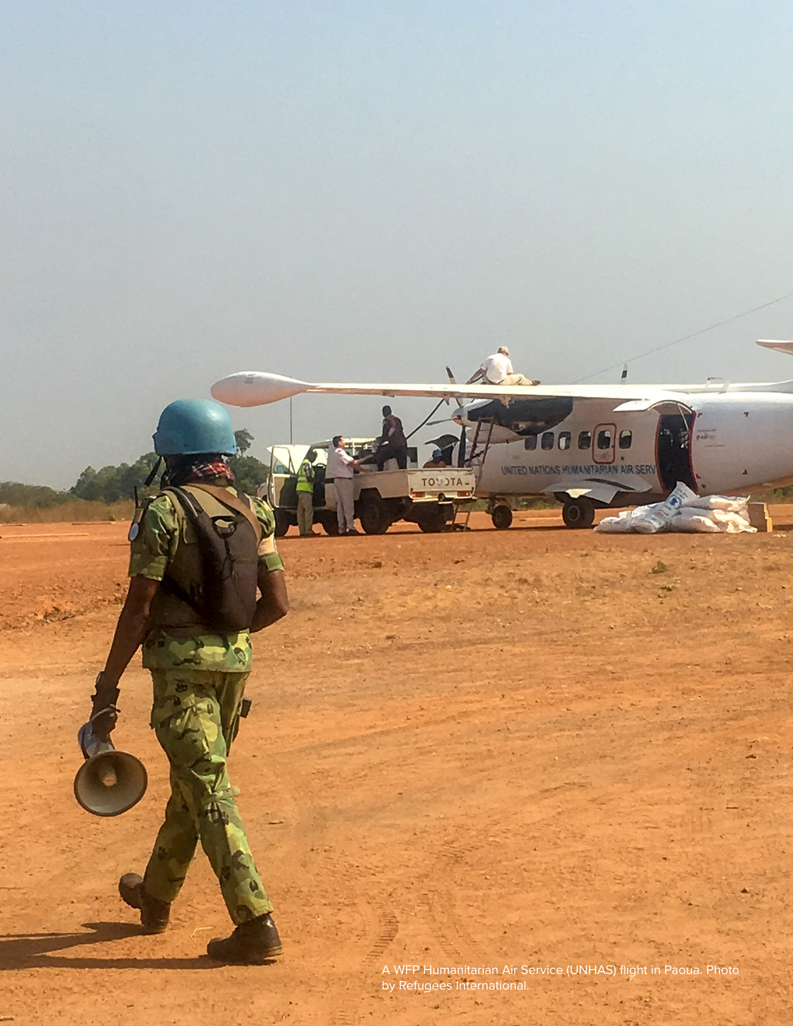
A WFP Humanitarian Air Service (UNHAS) flight in Paoua.