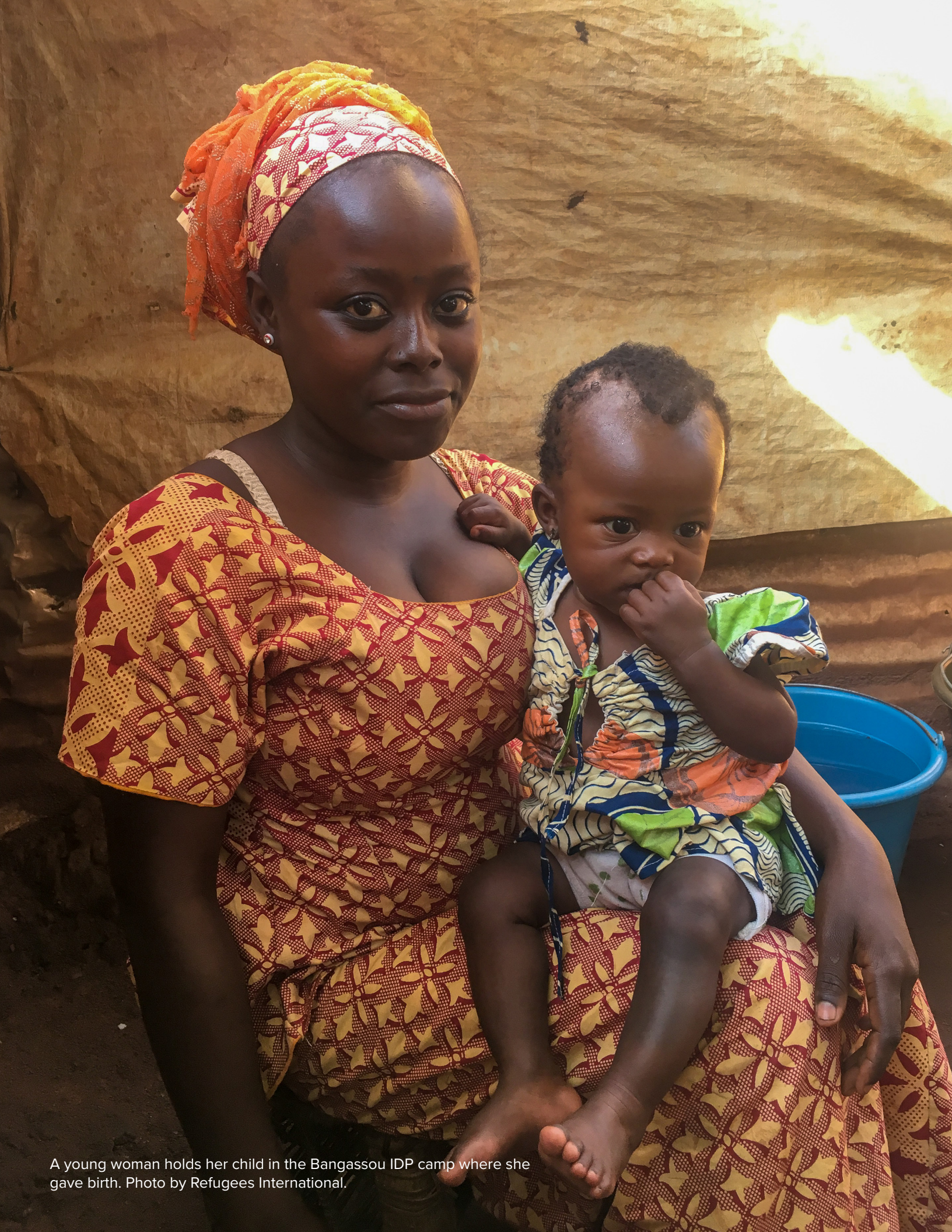
A young woman holds her child in the Bangassou IDP camp where she gave birth.