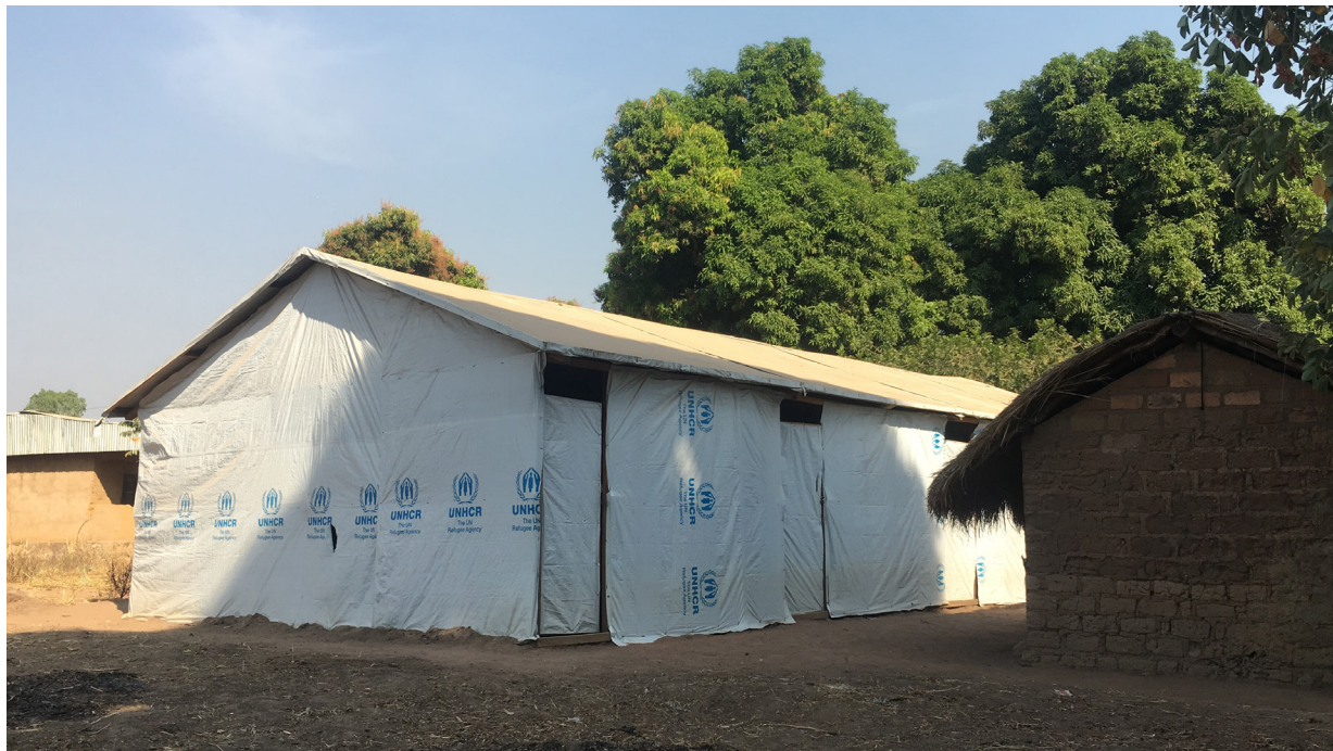
Former IDP shelter in Paoua.