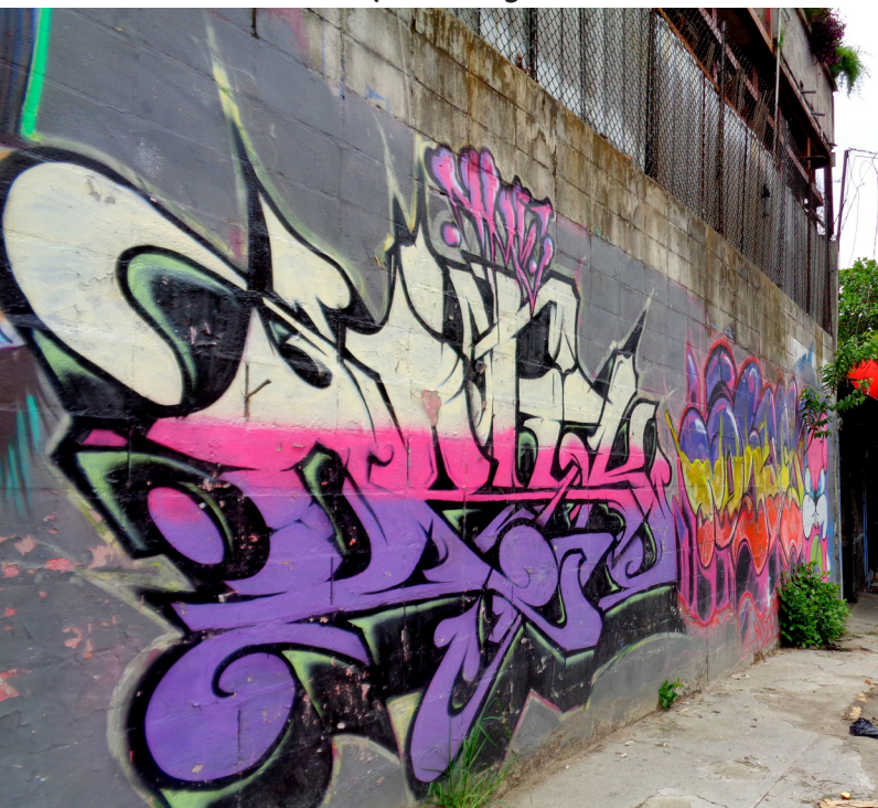
Graffiti in San Salvador's Mejicanos neighborhood.

Each situation such as this represents a crisis for a family and an emergency for CSOs, who try to support displaced families because the government will not. The government must publicly acknowledge that gangs and some police and military actors are causing internal and external displacement from El Salvador and commit to developing and implementing a humanitarian response. It should also add specific questions to the 2017 national census that facilitate the collection of data on how many people have fled their homes due to violence, where they have relocated, and the demographics of their households.