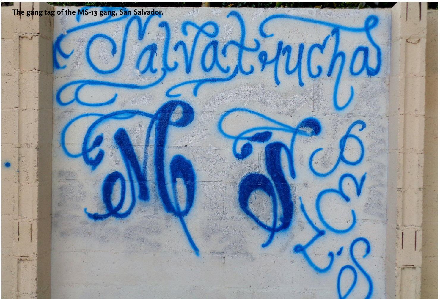
The gang tag of the MS-13 gang, San Salvador.

The Central American Minors (CAM) Refugee/Parole was created in direct response to the unprecedented amount of unaccompanied minors who arrived at the U.S. border in 2014. Although described as a refugee program, only children who have a parent legally present in the U.S. are eligible to apply. If they are allowed to enter the U.S., children can then apply