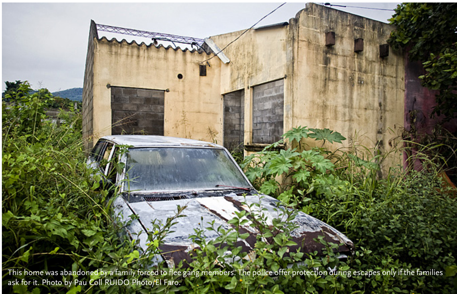
This home was abandoned by a family forced to flee gang members. The police offer protection during escapes only if the families ask for it.

so many people on the run go to women's and children's centers first, and arrive at CSOs only after they have been told that government shelters will not accept them.