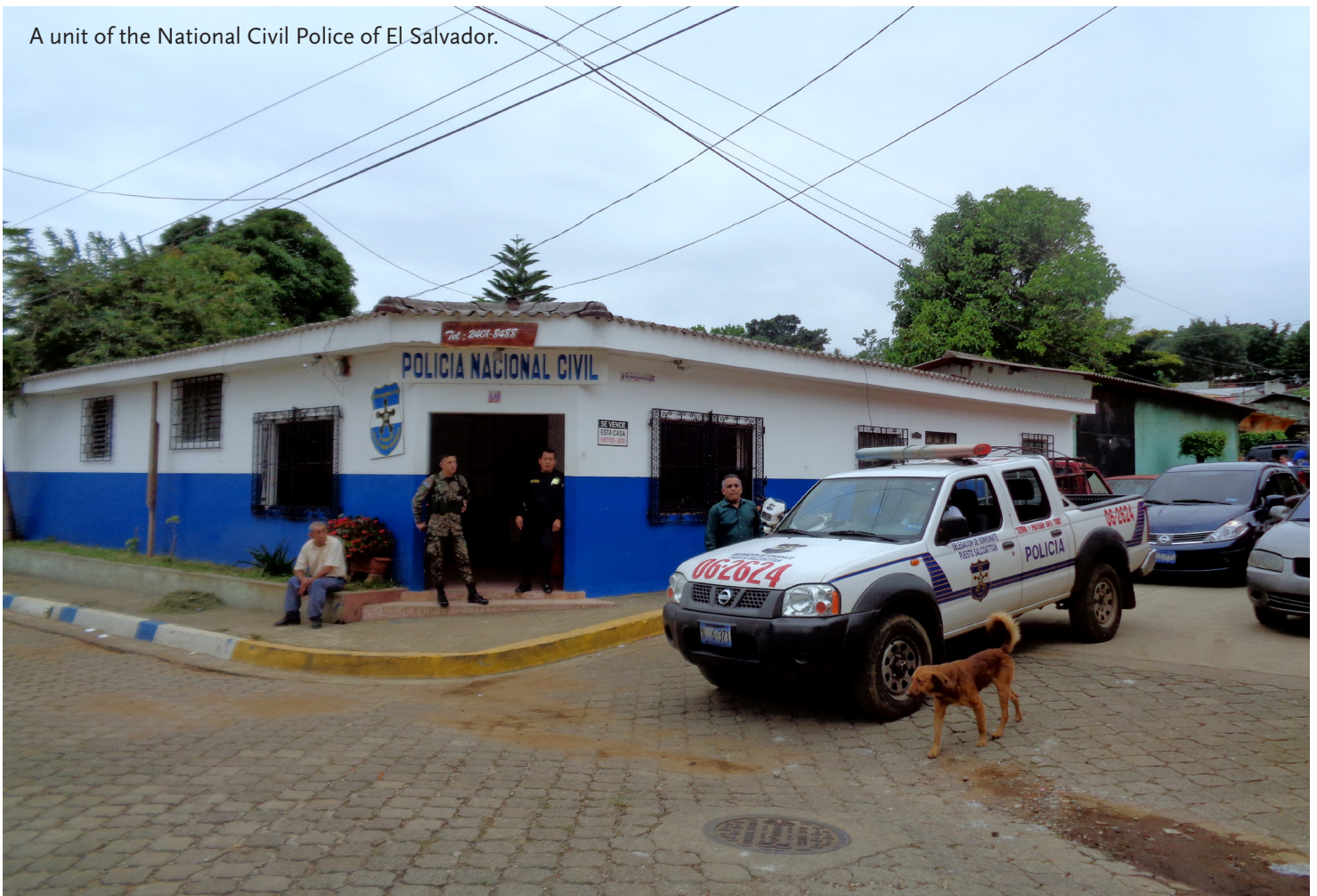
A unit of the National Civil Police of El Salvador.

Countries that receive Salvadorans in the region must be generous and flexible in their support of people fleeing gangs. A variety of measures could extend protection to those who need it without overextending neighboring states. With the support of UNHCR, states should ensure that all Salvadorans expressing a fear of serious human rights violations, persecution, or torture be given the opportunity to articulate their fear of return before an officer authorized to adjudicate asylum applications consistent with the Refugee Convention, Cartagena Declaration and Brazil Plan of Action, and other complementary forms of protection. The UNHCR should also help states build the capacity to receive and absorb refugees, as for many of these countries, the arrival of large numbers of refugees from the Northern Triangle is a new phenomenon.