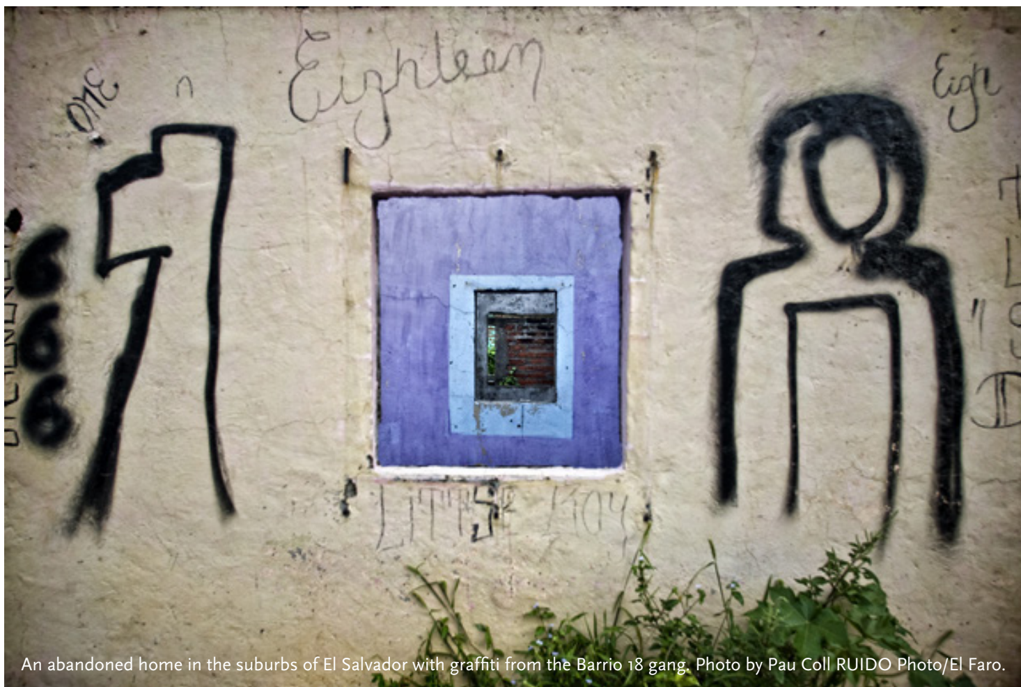
An abandoned home in the suburbs of El Salvador with graffiti from the Barrio 18 gang.

rights violations, persecution, and torture. Right now, El Salvador is unable to protect thousands of its citizens and this deficit is resulting in growing requests for international protection.