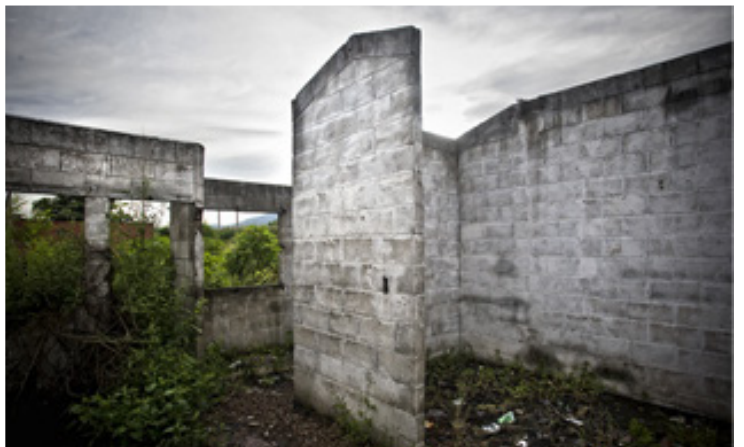
Homes abandoned by families fleeing gang violence.